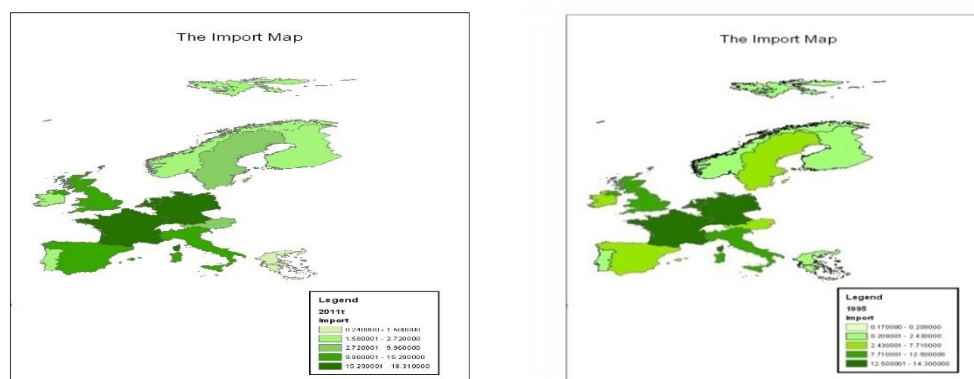
Map 2 Comparing geographical distribution of imports in the first region in 1995 and 2011